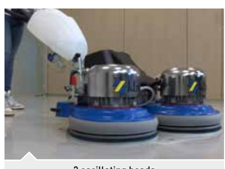
3 oscillating heads